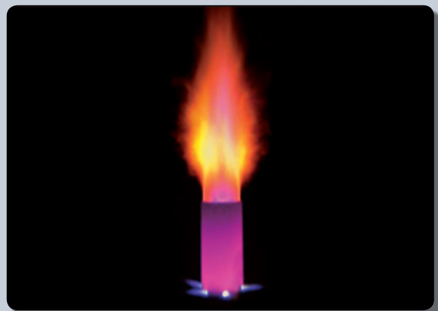
SM Series Pilot