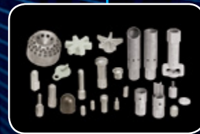
PARTS & SERVICE