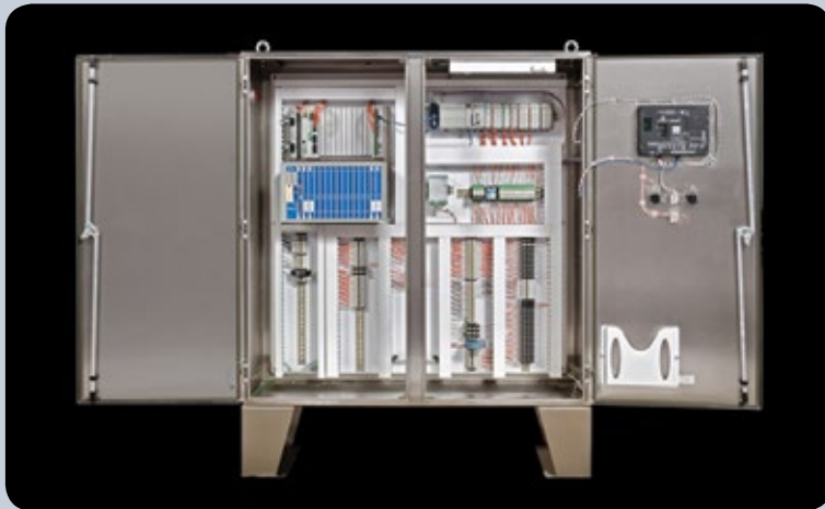
Burner Management System