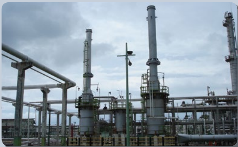
EN 746-2 Heater Upgrade