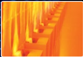
Ultra-Low NOx Ethylene Cracker Upgrade