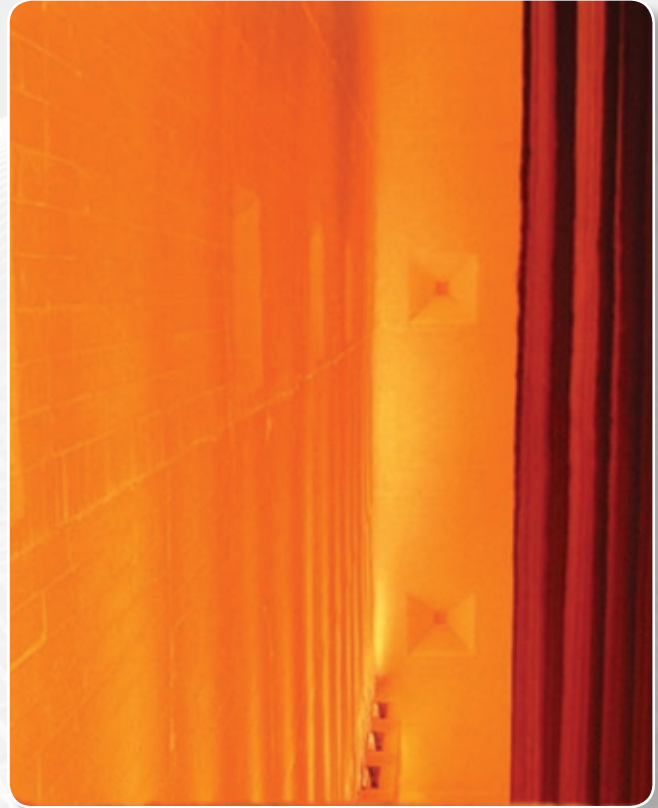
GLSF Enhanced Jet Burner, Horizontally Mounted