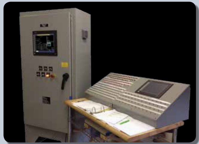
BMS/CCS Customer Factory Accepted Test