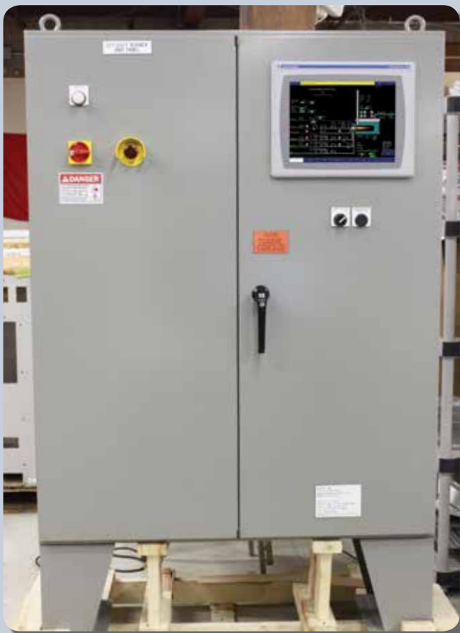
Completed BMS Enclosure

Whether you need to upgrade or replace your BMS or CCS, the time to make the right choice, is right now. Choose Zeeco and put our expertise and knowledge to work for you.