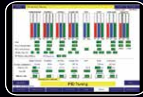
CCS HMI Tuning Screen