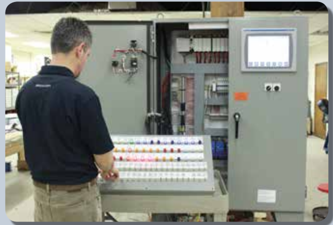
BMS Safety Simulation on Multi-Burner Boiler in Progress

ZEECO® Burner Management Systems (BMS) and Combustion Control Systems (CCS) ensure your operation remains in compliance with the latest environmental regulations and ultra-low NOx standards, while maximizing efficiency and eliminating downtime due to aging controls.