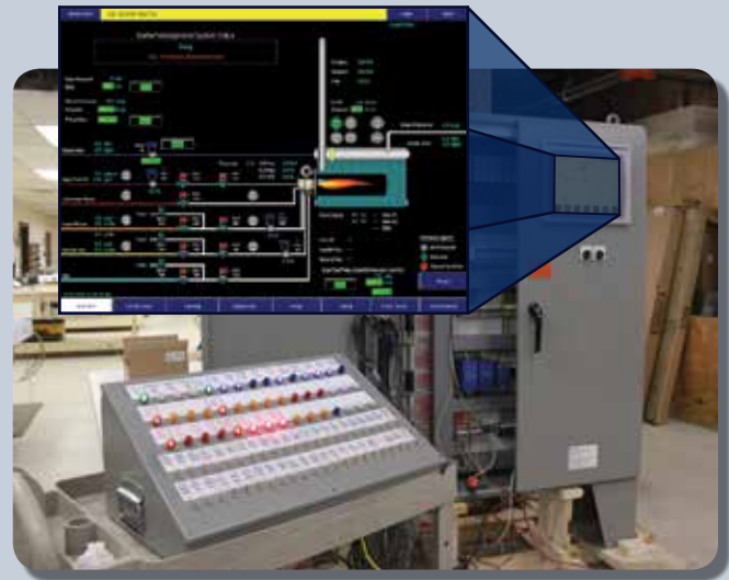
Package Boiler BMS HMI Overview Screen