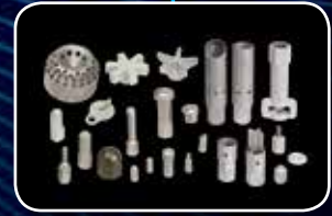
PARTS & SERVICE